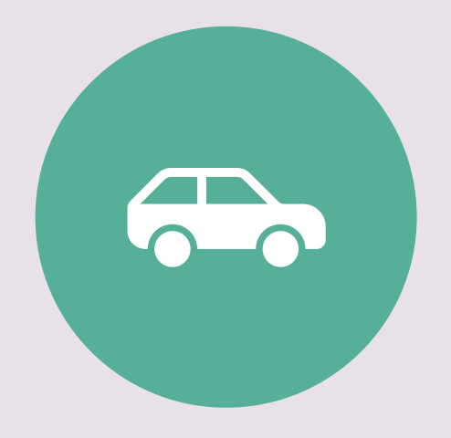
PREVENT DISTRACTED DRIVING