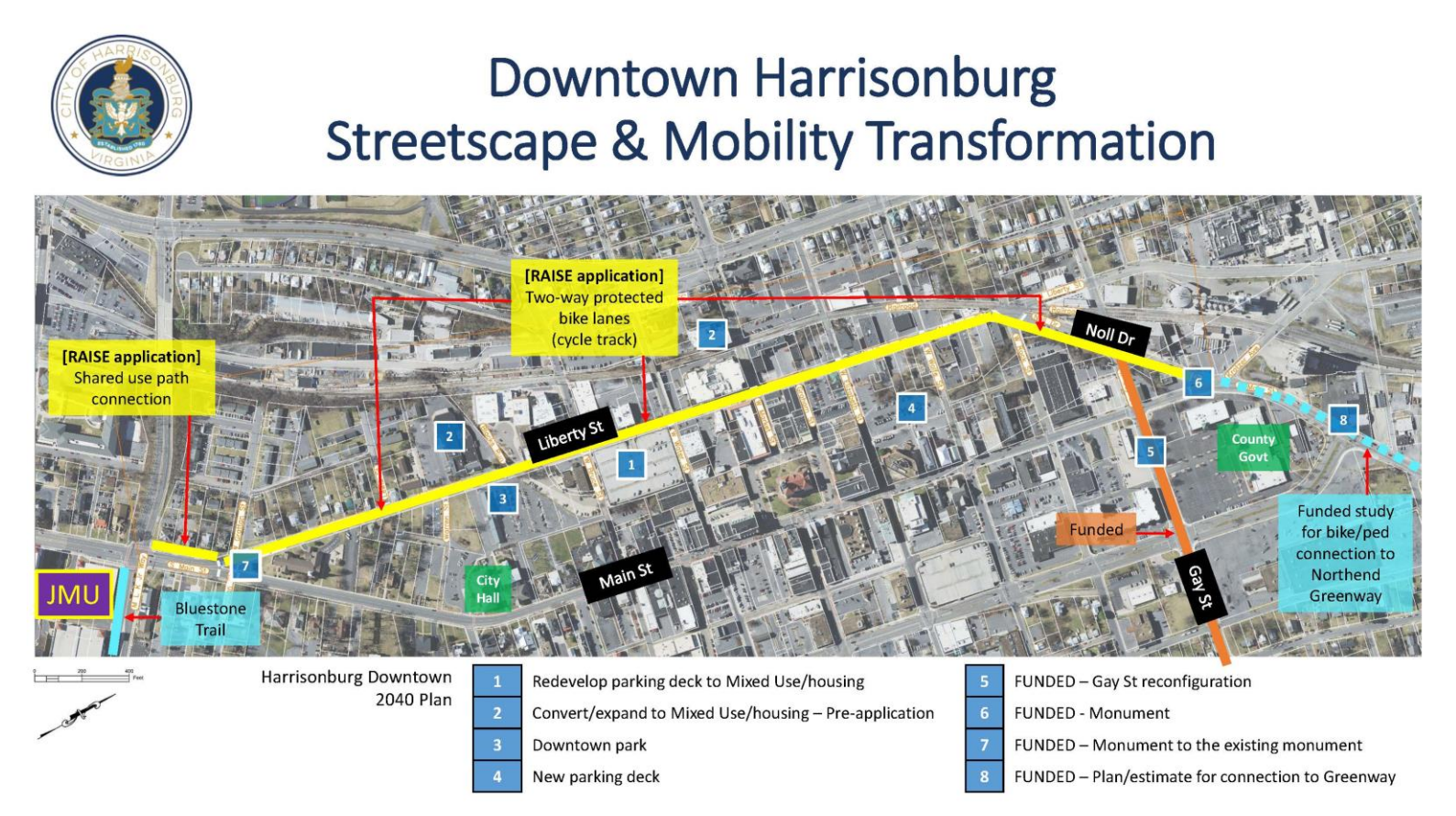
Above) A preliminary image of planned Liberty Street improvements.

More information on this project will be available as it moves forward. Design work will begin in the coming weeks, with construction currently estimated to take place in 2027.