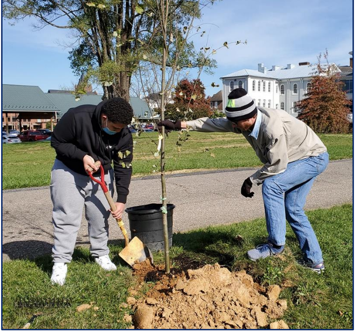
(Above) Two volunteers plant a tree outside the municipal complex in Downtown Harrisonburg. This year's event will bring more needed trees to our local canopy.

The event will start with a check in and distribution of supplies at the Lucy F. Simms Continuing Education Center parking lot, and volunteers will receive a map of the specific section in which they will be cleaning up. Participants are encouraged to stop by the Harrisonburg Public Works Green Scene, which features educational exhibits and activities about the environment. Once volunteers have received their supplies, and visited the Green Scene, they will proceed to their clean up location.