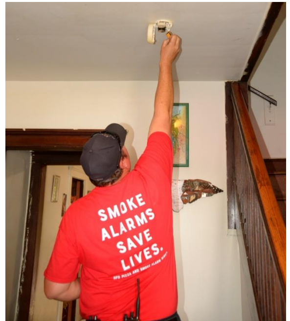
(Above) A HFD member inspects a smoke alarm inside a Harrisonburg home. Call the Fire Department at 540-432-7703 if you need help with a smoke alarm in your home.