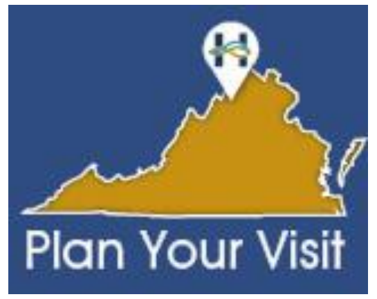
(Above) Look for this image when downloading the app to your mobile phone.

The Visit Harrisonburg Trip Planner app also has a social component. Once the user develops a plan it can be shared directly with others through social media, email or SMS. Harrisonburg's app is distinguishable in the app stores by an icon of the state of Virginia with a map marker with the Harrisonburg H pointing to the Harrisonburg area on the map.