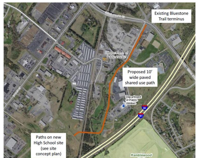
The Bluestone Trail Extension

Bluestone Trail Extension – The project closes a 0.7-mile gap between two sections of the Bluestone Trail – a 10-foot-wide paved shared use path – between its current terminus at Stone Spring Road to the new high school that is currently under construction. Path construction on the high school campus extends the Bluestone Trail another 0.5 miles further south. The majority of this project is on independent alignment through City-owned property. A bridge over Blacks Run and the parallel railroad is needed to make this connection.