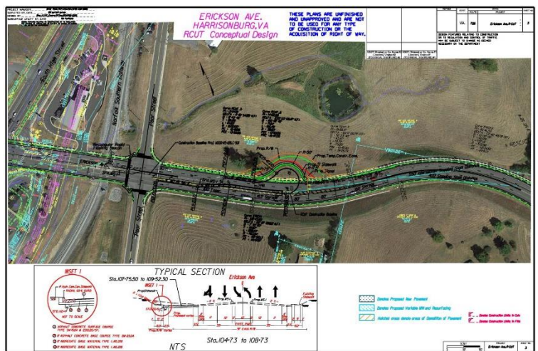
Pear Street at Erickson Avenue

– This project creates a modified Restricted Crossing U-Turn at the intersection of Pear Street and Erickson Avenue as an alternative to a warranted traffic signal. Three out of four left turns, as well as the through movements on the minor approaches, will be redirected to signalized U-turns. A signal will be added at the new U-turn location. A bulb-out design at the new U-turn will accommodate buses. Marked crosswalks will be provided at the Pear Street intersection, including a pedestrian refuge and flashing pedestrian beacon to cross Erickson Avenue.