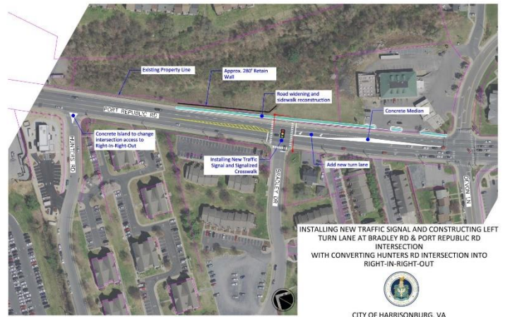
The Port Republic Road corridor

Port Republic Road Corridor Improvements – This project adds a traffic signal, including signalized crosswalks, at the Port Republic Road/Bradley Drive intersection. Port Republic Road will be widened to create a westbound left-turn lane with approximately 100 feet of storage and 100-foot taper. Sidewalk and bike lane will be reconstructed. A 3-foot-wide concrete median will be constructed along the entire segment between the Bradley Drive and Devon Lane intersections. A channelizing island will be added at the Hunters Road/Port Republic Road intersection to prohibit left turns.