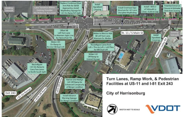
South Main Street at Interstate 81

– On South Main Street at the Interstate 81 Exit 243/Covenant Drive intersection, the southbound approach and on-ramp will be widened to allow dual left-turn lanes from South Main Street onto the on-ramp; the southbound left-turn lanes will be extended to improve storage. The westbound approach will be widened to allow dual left-turn lanes onto southbound South Main Street; the westbound left-turn lane storage will be extended to improve storage and clarify yield and merge conditions. The northbound left-turn lane will be offset from the southbound left-turn lane to maintain the permissive left-turn movement (no widening needed). An overhead wayfinding sign will be added along the southbound approach to the interchange for I-81 on South Main Street. A sidewalk will be constructed from the Holiday Inn Express to Pleasant Valley Road, along the west side of South Main Street, and a pedestrian signal will be added to the South Main Street/Pleasant Valley Road intersection.