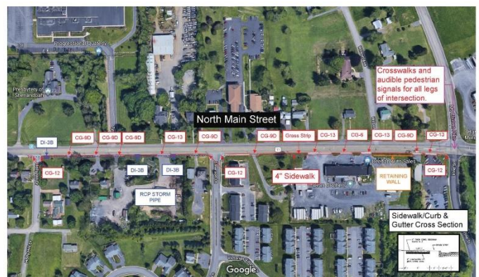
North Main Street Sidewalk

North Main Street Sidewalk – The project includes the construction of 1,800 linear feet of sidewalk from Holly Hill Drive to Vine Street. Existing curb and gutter will be reconstructed, and new curb and gutter will replace 750 feet of currently open drainage. Signalized crosswalks will be added at the intersection with Vine Street.