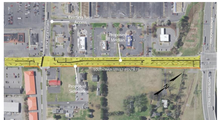
South Main Street Safety Improvements

South Main Street Safety Improvements – This project adds a 3-foot-wide concrete median on South Main Street from just south of Mosby Road to the intersection with Stone Spring Road/Erickson Avenue, with a break in the media to maintain a full-access entrance to Dukes Plaza. The median will prevent left turns into and out of many commercial entrances along this high-crash corridor. The project also adds a five-foot-wide sidewalk on the east side of South Main Street, and shelters at three bus stops to improve multimodal access on the corridor. A survey seeking public input on this project took place in August 2019.