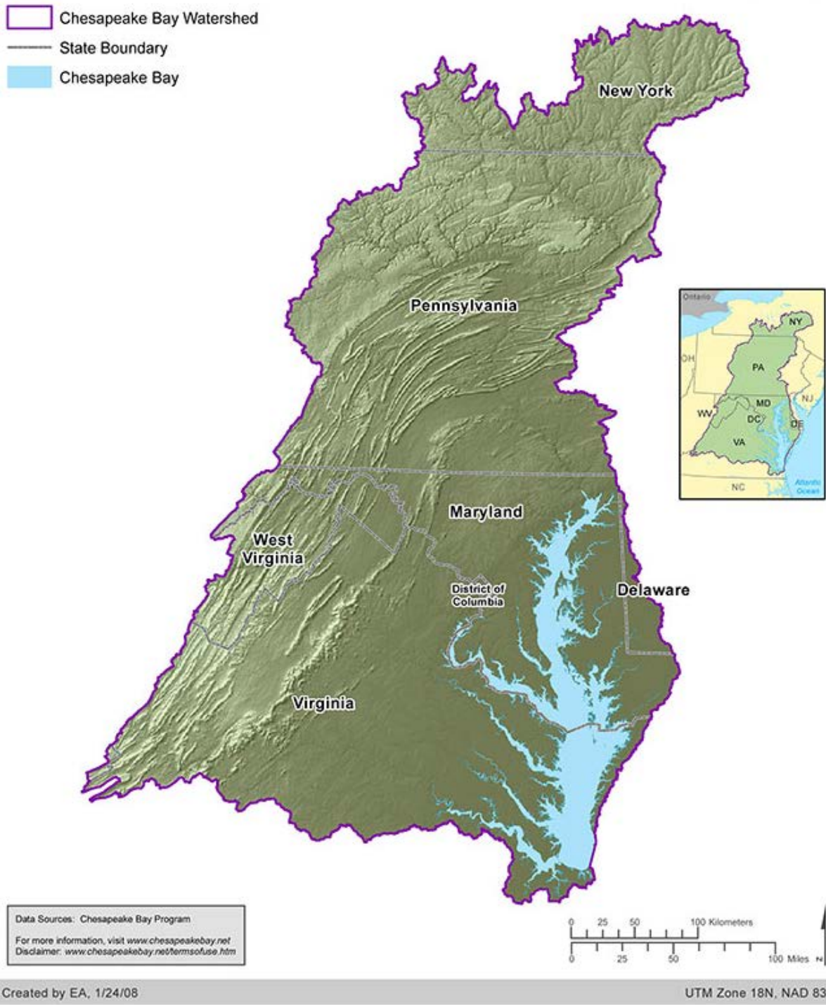
Figure 2. Chesapeake Bay Watershed Map

MS4 Permit requires the City of Harrisonburg to address impairments for phosphorus, nitrogen, and sediment that enter the Chesapeake Bay.