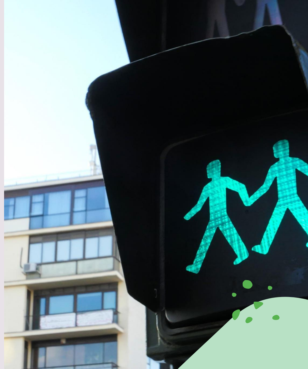
Photo Speed Camera Ordinance